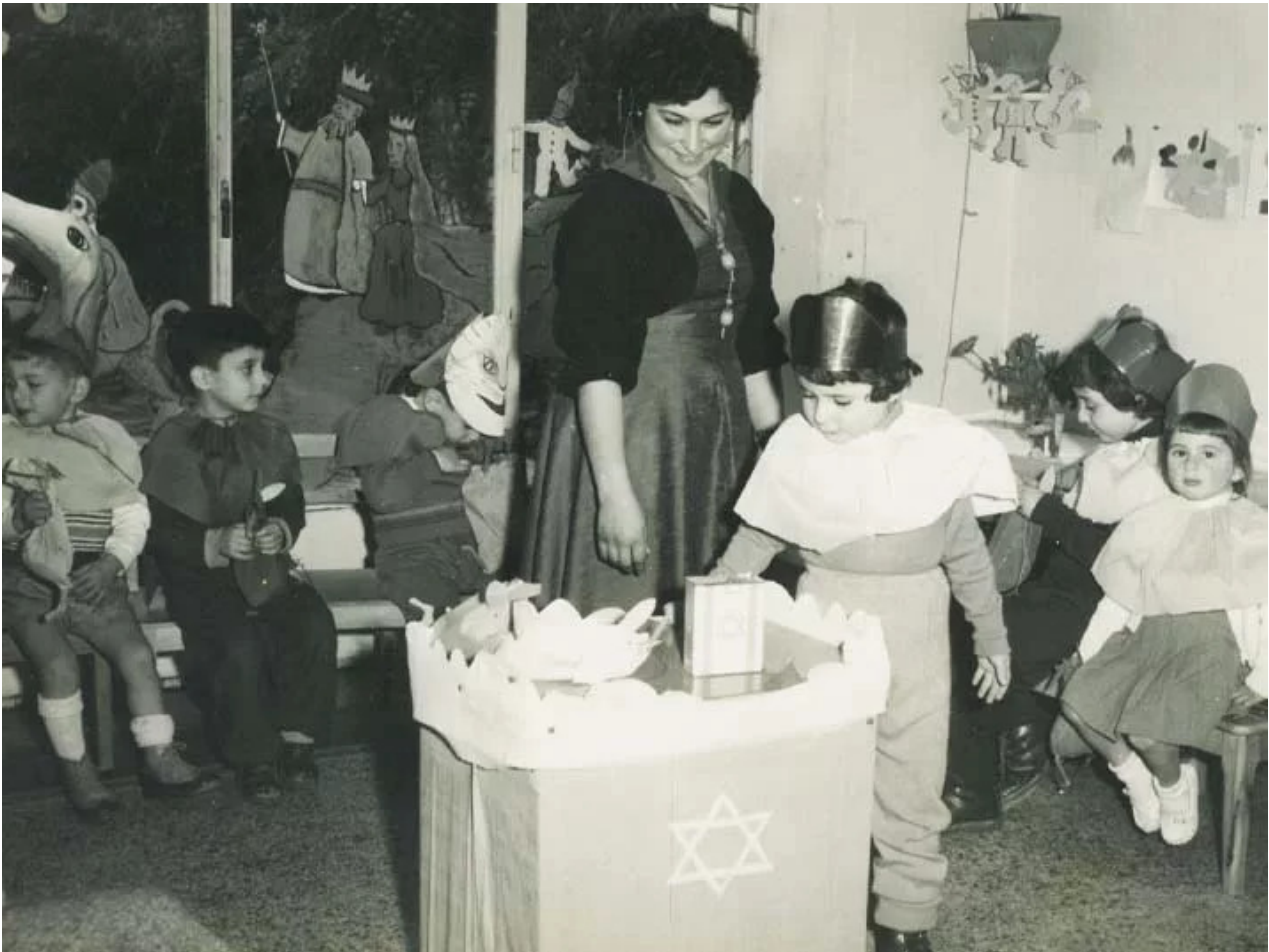
A little girl donates to the blue box at the Hebrew kindergarten in Casablanca, Morocco, 1954–1956.

With this move, the fund took a more aggressive role, especially under Ussishkin's rivalry with British Jerusalem Governor Sir Ronald Storrs. Ussishkin preempted the construction of a British university by launching the Hebrew University project, and persuaded High Commissioner Herbert Samuel to recognize Hebrew as an official language alongside English and Arabic.