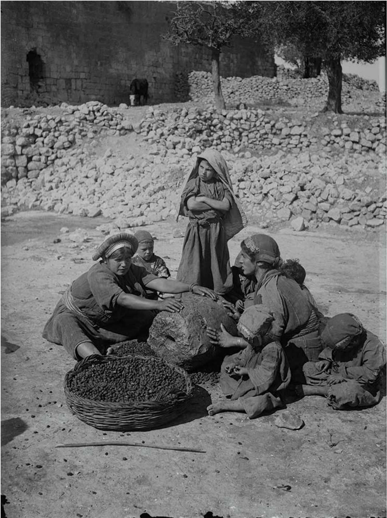
Women pressing olives, circa 1900–1920, accompanied by their children. Weaning in summer was avoided; spring was preferred when animal milk supply